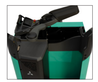
Storage compartment under armrest