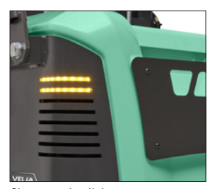
Clear warning light